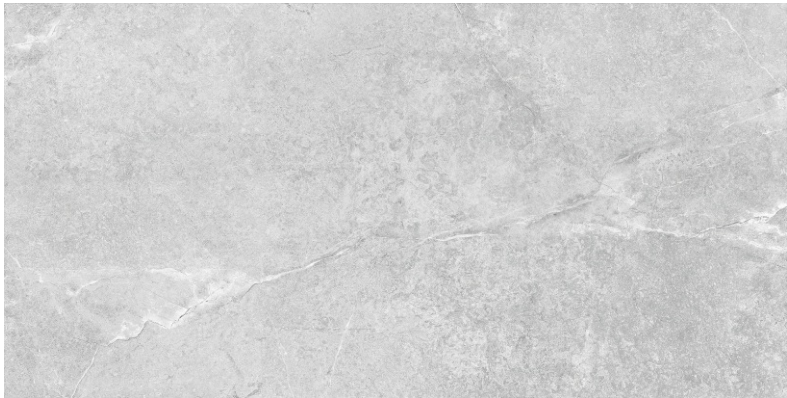
Ural Platino Natural Rettificato 60x120 cm

DOGMA® presents a new range of hygienic products DOGMA PROJECT ANTIBACTERIAL . The application of new technical glazes capable to stop the reproduction of bacteria guarantees antimicrobial protection to surfaces, ensuring a healthy environment, free of dirt and odor. The new technology applied to our ceramic tiles is ideal for all locations, especially with bacterial growth, such as kitchens, bars, restaurants, hotels, doctor's offices, schools, public c of s, baths, SPAs and swimming pools. Ideal for personal and commercial use. DOGMA PROJECT ANTIBACTERIAL achieves the progressive elimination of bacteria by blocking growth, interrupting their life cycle.