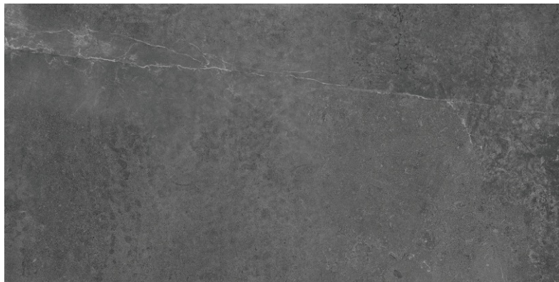
Ural Titano Natural Rettificato 60x120 cm

DOGMA® presents a new range of hygienic products DOGMA PROJECT ANTIBACTERIAL . The application of new technical glazes capable to stop the reproduction of bacteria guarantees antimicrobial protection to surfaces, ensuring a healthy environment, free of dirt and odor. The new technology applied to our ceramic tiles is ideal for all locations, especially with bacterial growth, such as kitchens, bars, restaurants, hotels, doctor's offices, schools, public places, baths, SPAs and swimming pools. Ideal for personal and commercial use. DOGMA PROJECT ANTIBACTERIAL achieves the progressive elimination of bacteria by blocking growth, interrupting their life cycle.